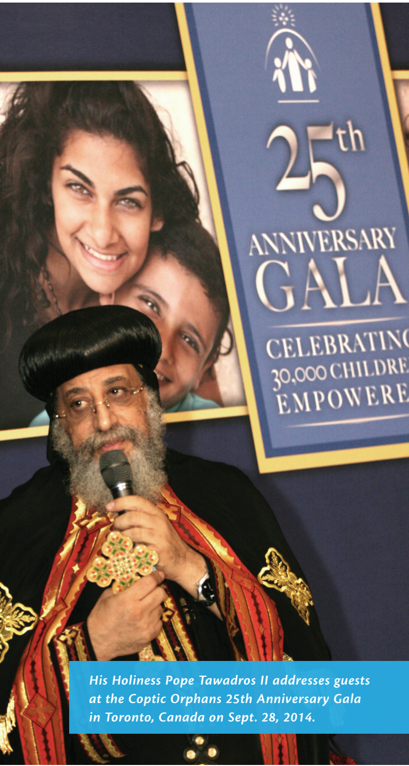
His Holiness Pope Tawadros II addresses guests at the Coptic Orphans 25th Anniversary Gala in Toronto, Canada on Sept. 28, 2014.