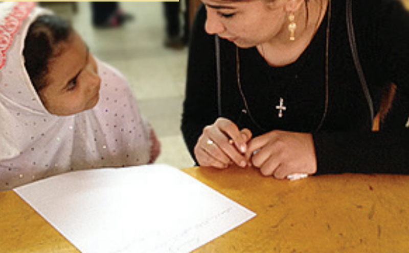
Little Sisters learn from their Big Sisters, who befriend them and teach them new skills as part of the Valuable Girl Project.

It’s no small thing to break — or even bend — the cycles of violence and poverty that afflict families in Egypt. Imagine, then, a project that tackles those cycles by equipping young women with leadership skills and a better education. Now imagine that this project also effectively promotes tolerance among Christians and Muslims, and you’ve got the Valuable Girl Project.