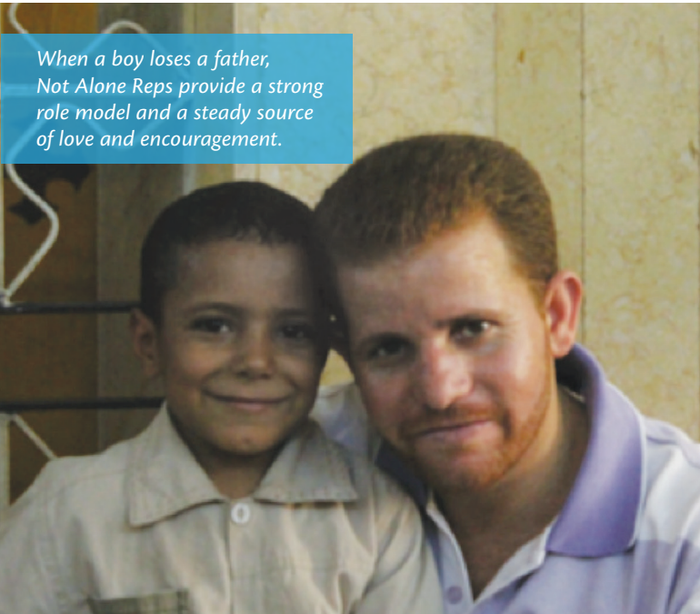
When a boy loses a father, Not Alone Reps provide a strong role model and a steady source of love and encouragement.

The Reps are volunteers, but their commitment goes far beyond that. In the darkest days of the church burnings, they showed their heroism, looking after their children despite threats and mobs. That bravery continued in 2014, despite the threats of violence still afflicting Egyptian society. We depend on the Reps, our backbone, who are rooted in the Church’s millennia-old tradition of service and sacrifice.