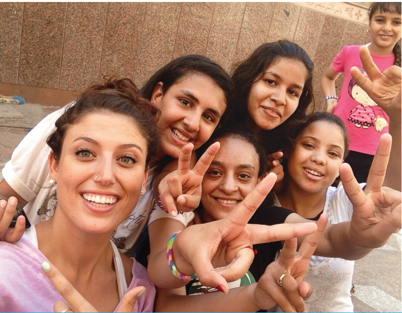
Serve to Learn volunteers come to Egypt from all over the world to experience a shared love of God alongside the children — and to inspire the kids with their passion for learning!

Serve to Learn’s 2014 trip reminded us how, in the words of His Holiness Pope Tawadros II, “you won’t find anything more beautiful” than young people serving their brothers and sisters in Christ in Egypt.