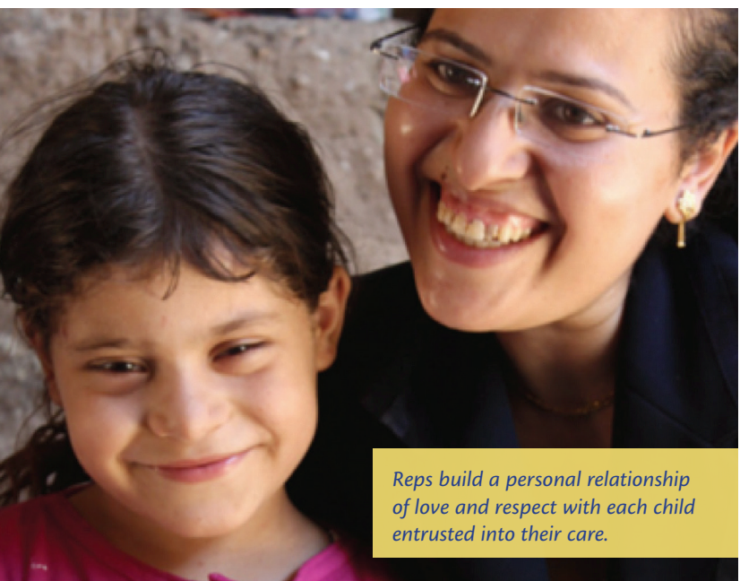
Reps build a personal relationship of love and respect with each child entrusted into their care.

Illiteracy, truancy, trauma, poverty, early marriage — our Church-based volunteers spent 2014 tackling challenges like these on a daily basis. For 25 years, these heroes have been the backbone of Coptic Orphans’ work in Egypt, spending their time and resources by mentoring and advocating for orphans.