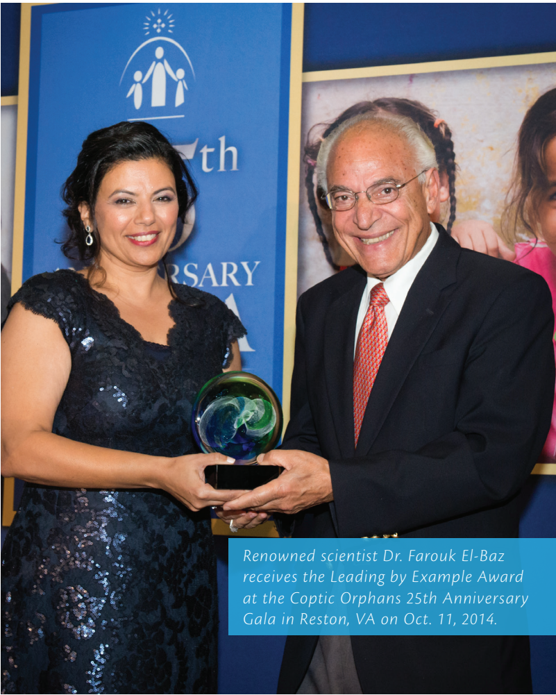
Renowned scientist Dr. Farouk El-Baz receives the Leading by Example Award at the Coptic Orphans 25th Anniversary Gala in Reston, VA on Oct. 11, 2014.