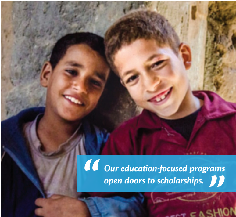
“ Our education-focused programs open doors to scholarships. ”