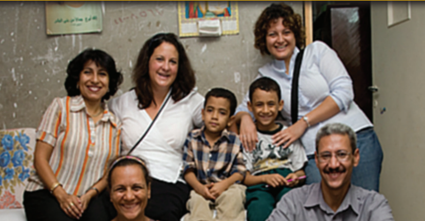
Sponsors and donors are the heart of Coptic Orphans. Everything we've accomplished together in these 25 years has been because of God's grace and through your prayers, love, support, and visits to the children!

The theme of celebration resounded throughout 2014, and for good reason: Coptic Orphans was marking 25 years of joyful service to God. In those years, by His grace, we educated and empowered 30,000 Egyptian children.