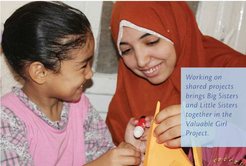
Working on shared projects brings Big Sisters and Little Sisters together in the Valuable Girl Project.