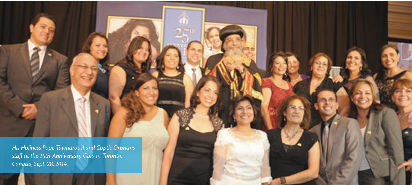
His Holiness Pope Tawadros II and Coptic Orphans staff at the 25th Anniversary Gala in Toronto, Canada, Sept. 28, 2014.