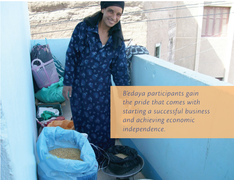
B’edaya participants gain the pride that comes with starting a successful business and achieving economic independence.

B’edaya succeeds for many reasons, especially the resilience of Egypt’s widows. But it also succeeds because it doesn’t focus on these women’s weaknesses — instead, it harnesses their strengths. That’s the key to success.