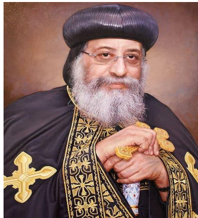
H.H. Pope Tawadros II Pope and Patriarch of Alexandria and the See of Saint Mark