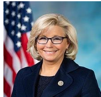
Honorable Elizabeth Cheney Former United States Representative