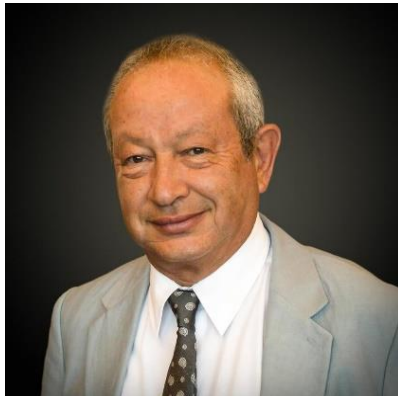
Mr. Naguib Sawiris Egyptian Businessman and Philanthropist