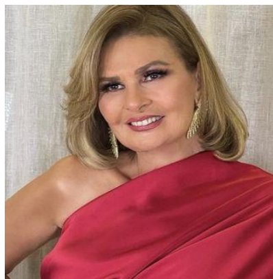
Ms. Yosra Egyptian Actress and Former U.N. Goodwill Ambassador