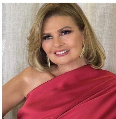
Ms. Yosra Egyptian Actress and Former U.N. Goodwill Ambassador