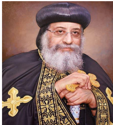
H.H. Pope Tawadros II Pope and Patriarch of Alexandria and the See of Saint Mark