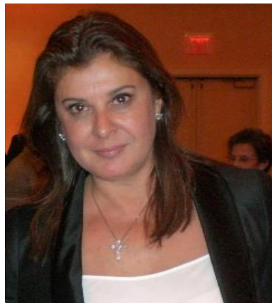
Ola Ghabbour Founder of Egypt's first Children's Cancer Hospital