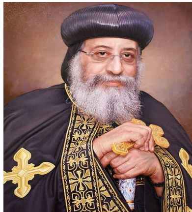
H.H. Pope Tawadros II Pope and Patriarch of Alexandria and the See of Saint Mark