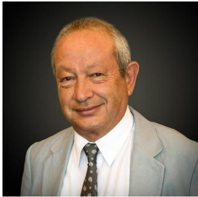
Mr. Naguib Sawiris Egyptian Businessman and Philanthropist