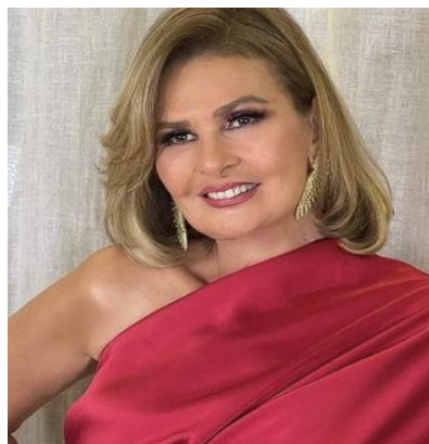
Ms. Yosra Egyptian Actress and Former U.N. Goodwill Ambassador