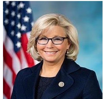
Honorable Elizabeth Cheney Former United States Representative