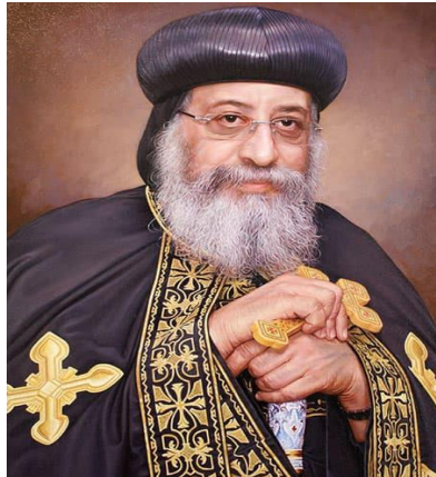
H.H. Pope Tawadros II Pope and Patriarch of Alexandria and the See of Saint Mark