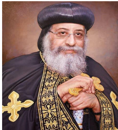
H.H. Pope Tawadros II Pope and Patriarch of Alexandria and the See of Saint Mark