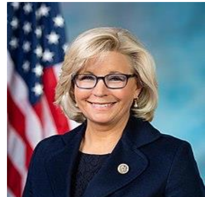
Honorable Elizabeth Cheney Former United States Representative