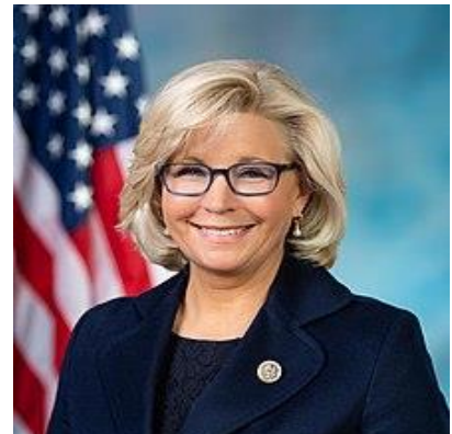
Honorable Elizabeth Cheney Former United States Representative