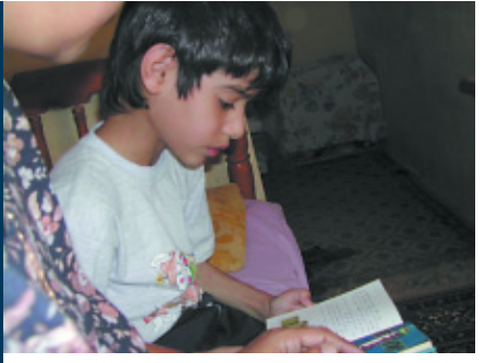
A Rep reads with one of the children.

"Investing in children's abilities to read, write, and do basic math is key to an improved quality of life and to poverty alleviation." —UK Department for International Development