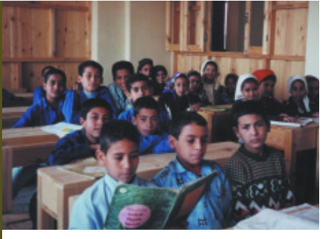
A typically segregated Egyptian classroom

On November 21, 2002, the Society for International Development-Washington recognized the Valuable Girl Project by awarding its program manager the Truman Award of Leadership and Innovation for Young Professionals in International Development.