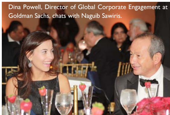
Dina Powell, Director of Global Corporate Engagement at Goldman Sachs, chats with Naguib Sawiris.