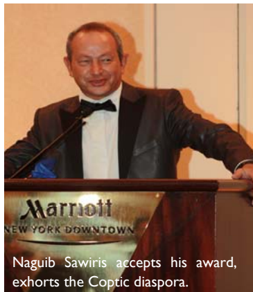
Naguib Sawiris accepts his award, exhorts the Coptic diaspora.