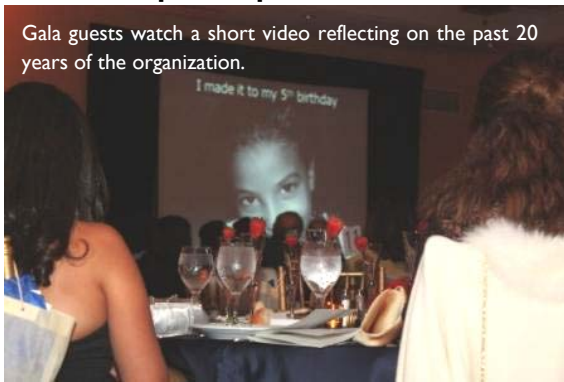
Gala guests watch a short video reflecting on the past 20 years of the organization.